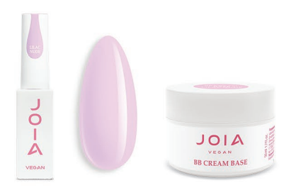
BB cream base Soft Milk JOIA vegan, 8, 15, 50 ml