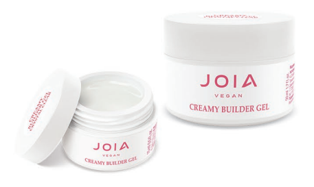
Creamy Builder Gel Pink Orchid JOIA vegan, 15, 50 ml